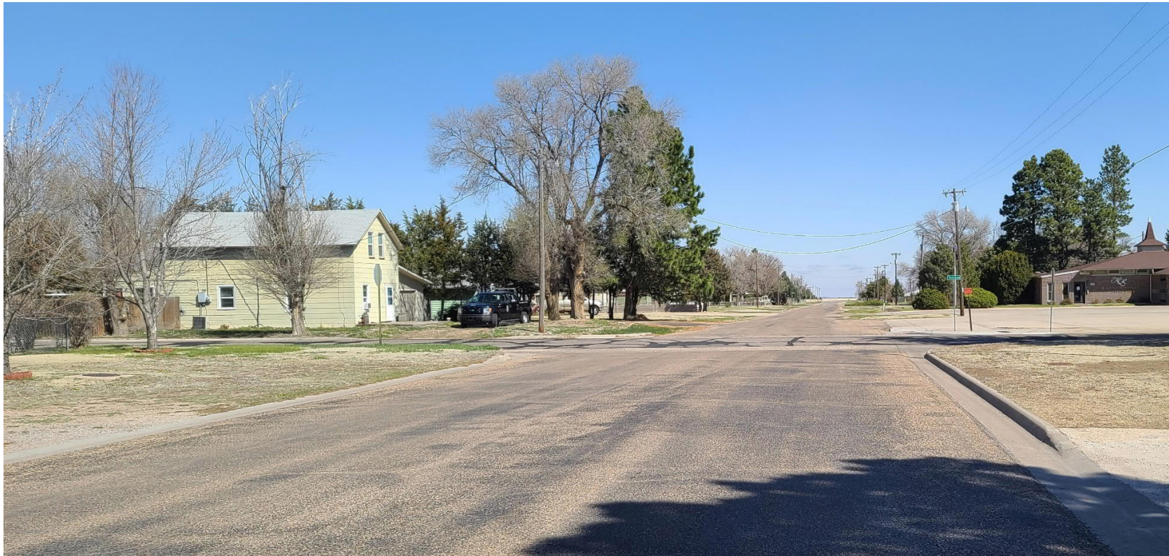
← Toelkes/Main Intersection: Northbound on Main