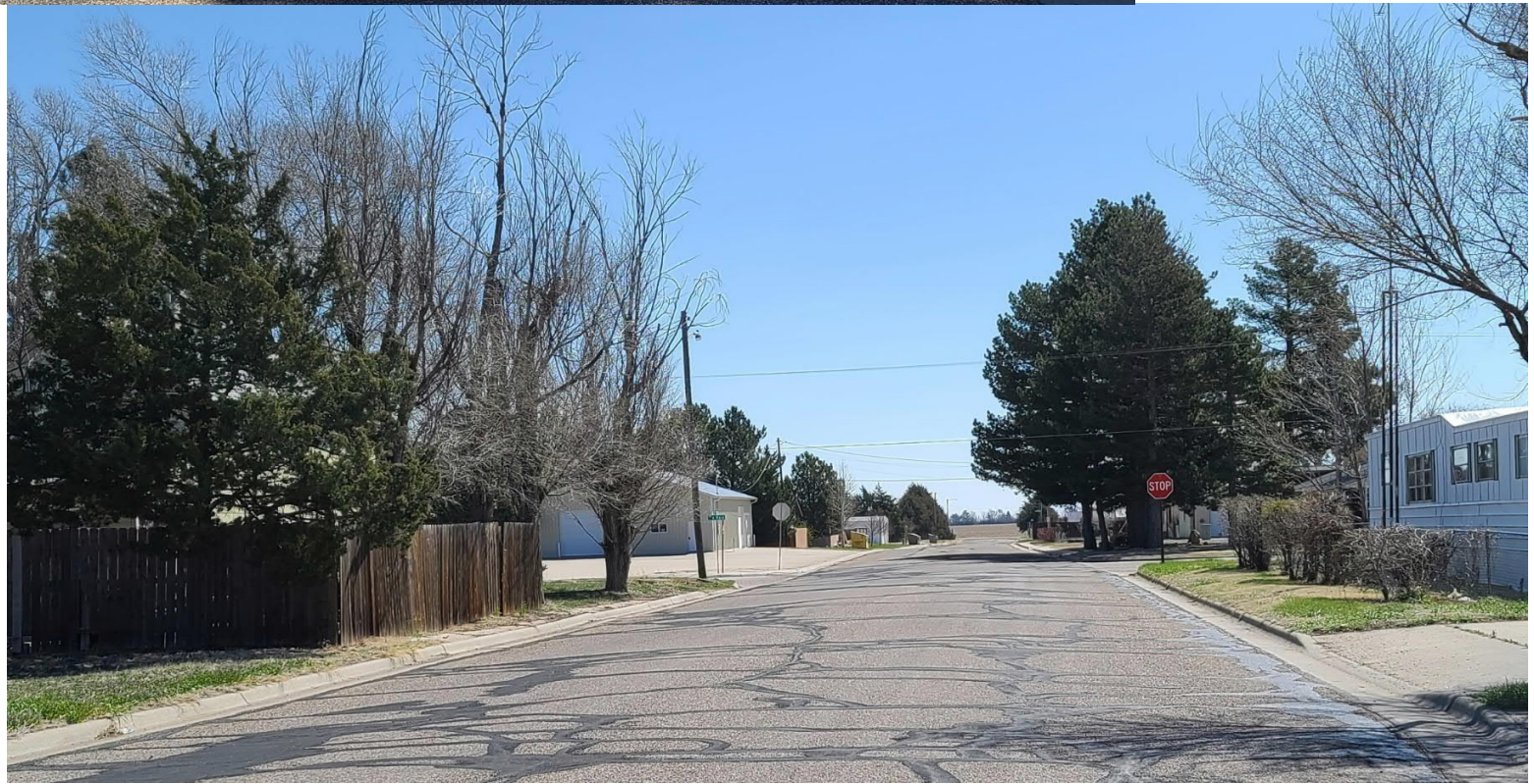
→ Toelkes/Main Intersection: Eastbound on Toelkes